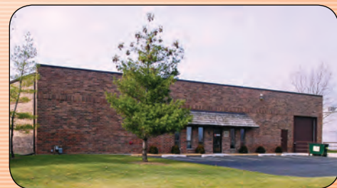
Orland Park, Illinois

Since 1978, Donson Machine has grown by investing in the best machining technology & expertise in the industry. Our goal is to consistently exceed customer expectations for service and quality. Registered to ISO 9001 and ISO 13485, we operate multi-shift production facilities in Alsip and Orland Park, Illinois. Donson is the preferred precision machining source for industry-leading OEM customers in Medical Equipment, Orthopedics, Industrial Automation and Aerospace.